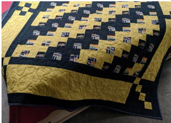
Army quilt made in 2007. Has little pictures of tanks and Humvees.

Next, onto my very first quilt made for son #1 to repair and label from 1981 when he was four. He is turning 43 this year and I can't wait to relive those feelings!