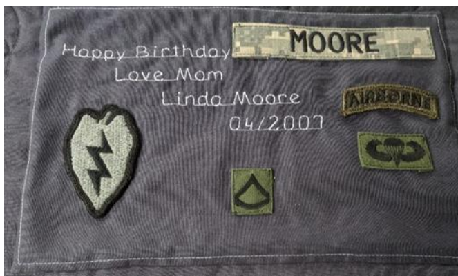
Quilt label finally completed April 2020, 13 years later.

So, what have you been doing during the COVID 19 stay at home order? We would love to know. Please send an email and let me know. I will include in the next edition of the WDCU newsletter.