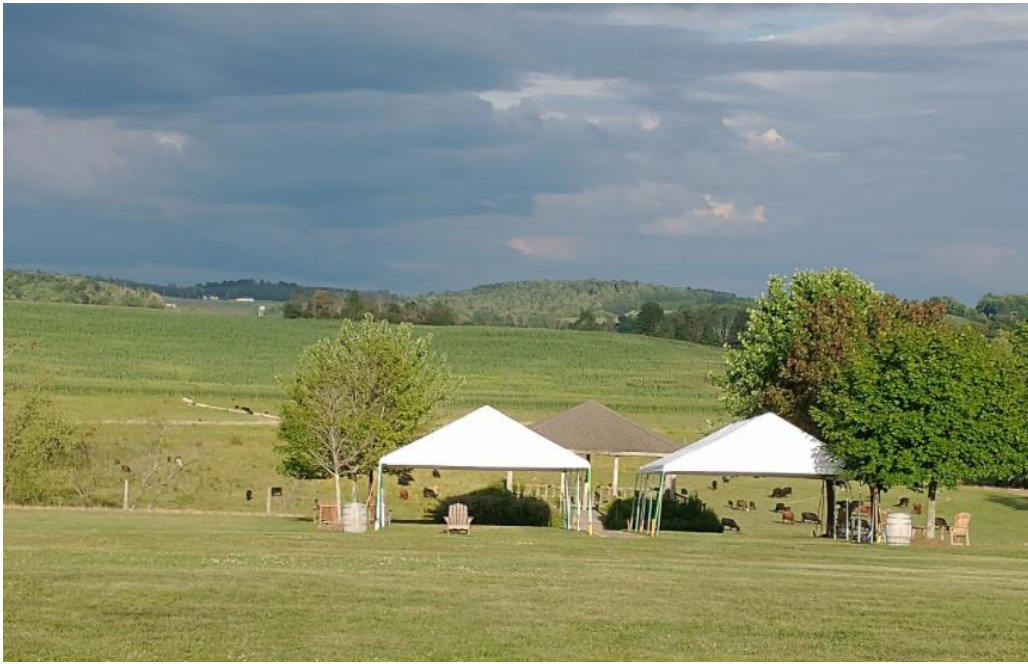
Our view at Glades Pike Winery, our Harvest Host location near the Flight 93 National Memorial.