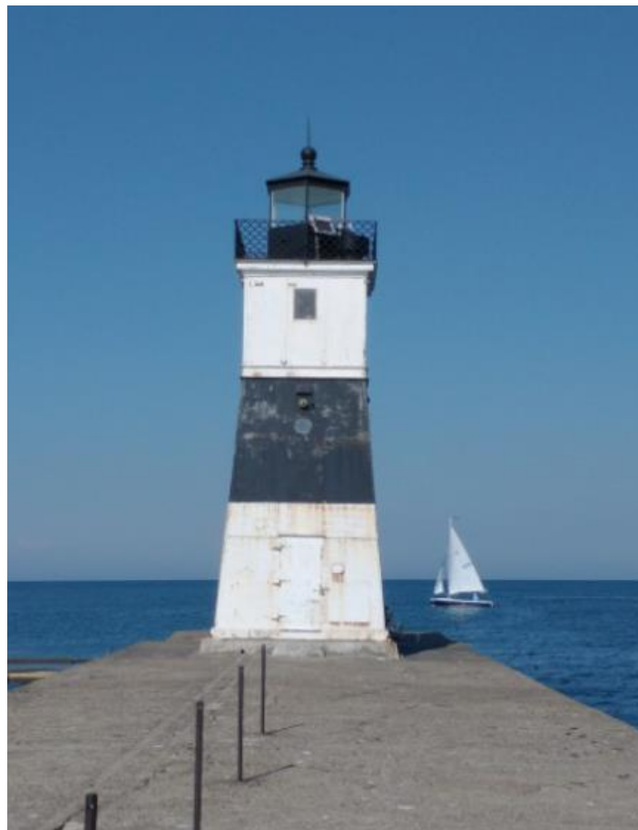
Lighthouse at Erie Bluffs State Park.