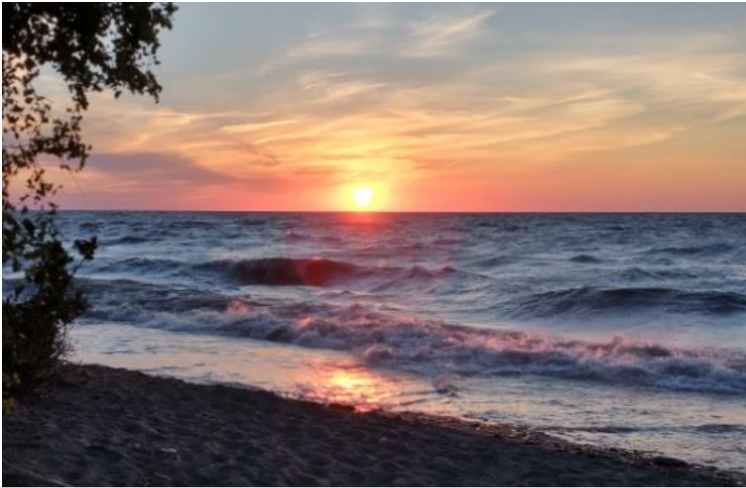
Lake Erie. I kept thinking I was at the ocean. Very weird!