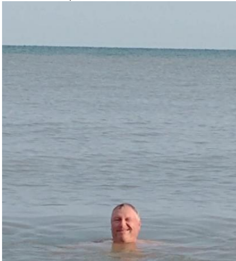
WAM taking a dip in Lake Erie.