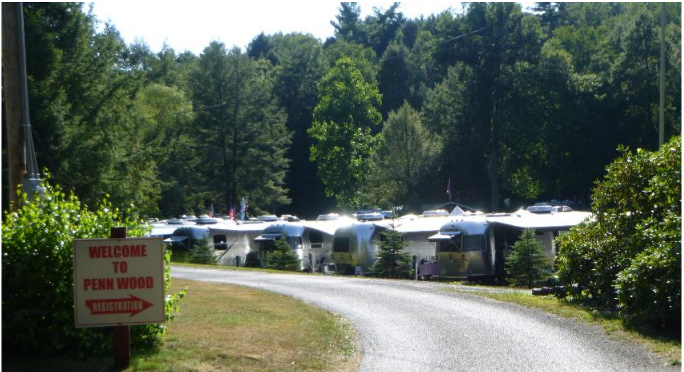
Penn Wood rally field. There were other units in attendance besides WDCU.