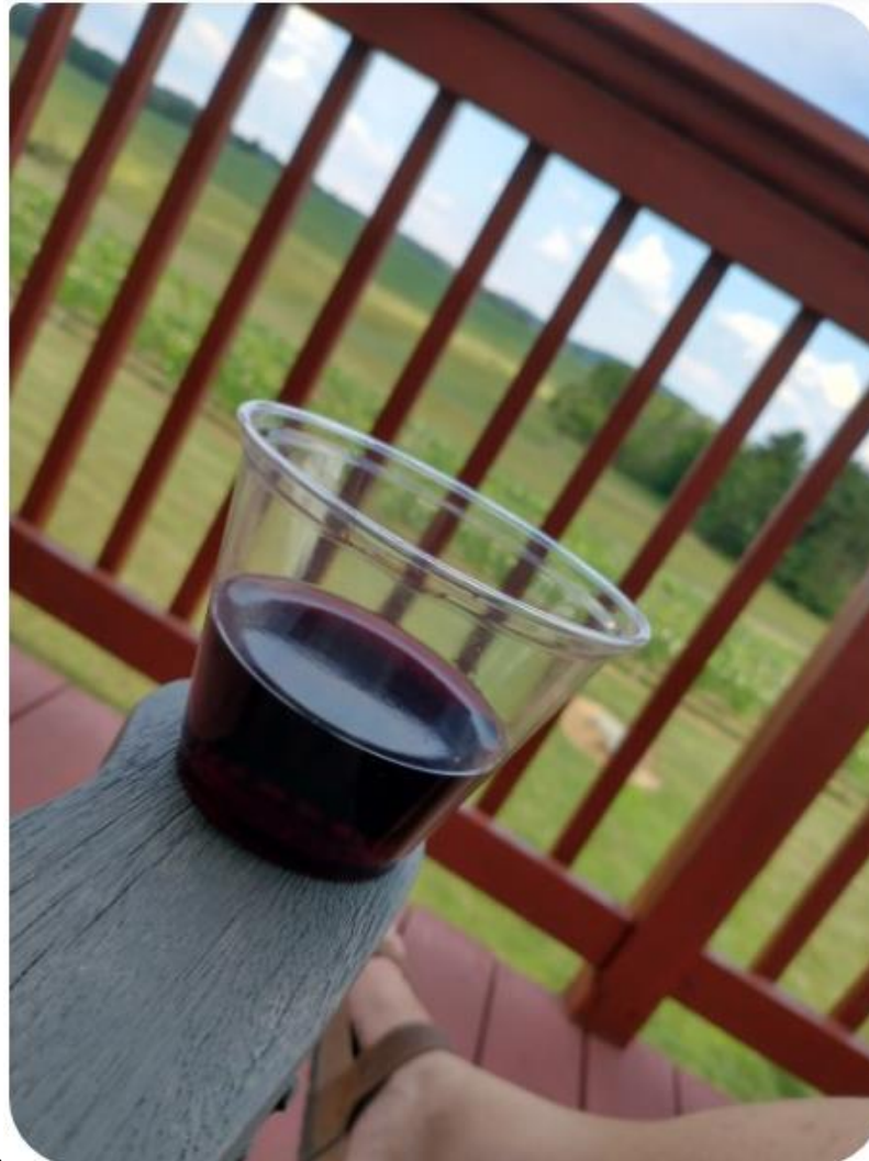
Enjoying Glades Pike Winery.