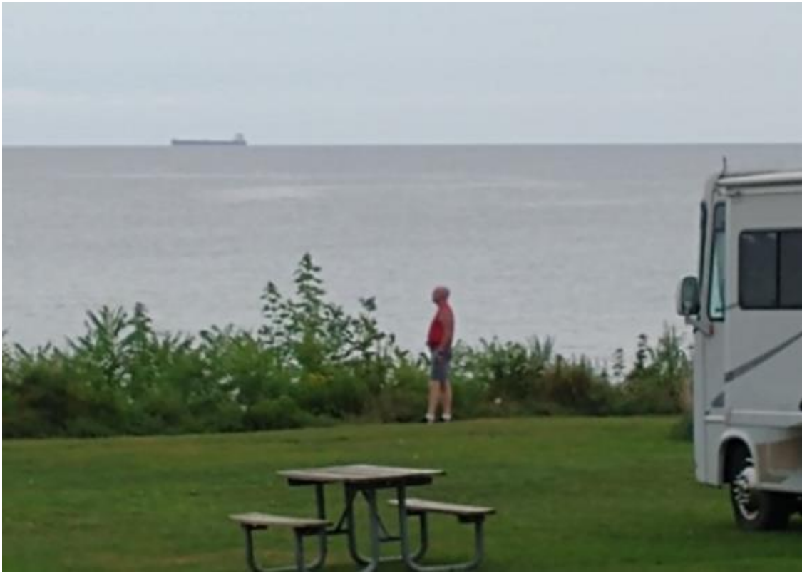
Our site view at Virginia's Beach Campground on Lake Erie. Nope, not WAM.