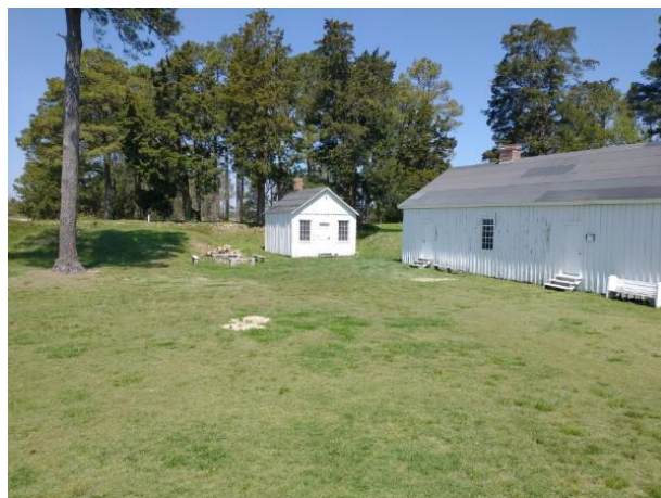
Point Lookout Redoubt